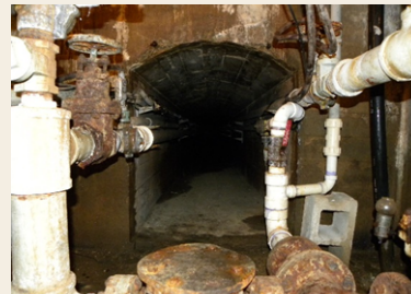
ORIGINAL FOUNTAIN PUMPS

Since 2014, there have been renovations and routine maintenance projects completed totaling 2.5 million dollars. Much of the original infrastructure from 1932 remains. Some recent renovations include: