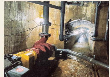
RENOVATED FOUNTAIN PUMPS